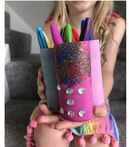
Isla's amazing chilli challenge 😊